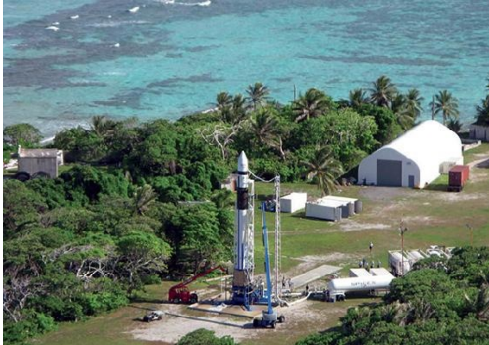
SpaceX had to conduct its first flights from Kwajalein Atoll (or Kwaj) in the Marshall Islands. The island experience was a difficult but ultimately fruitful adventure for the engineers.