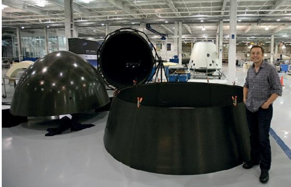
SpaceX's ambitions grew over the years to include the construction of the Dragon capsule, which could take people to the International Space Station and beyond.