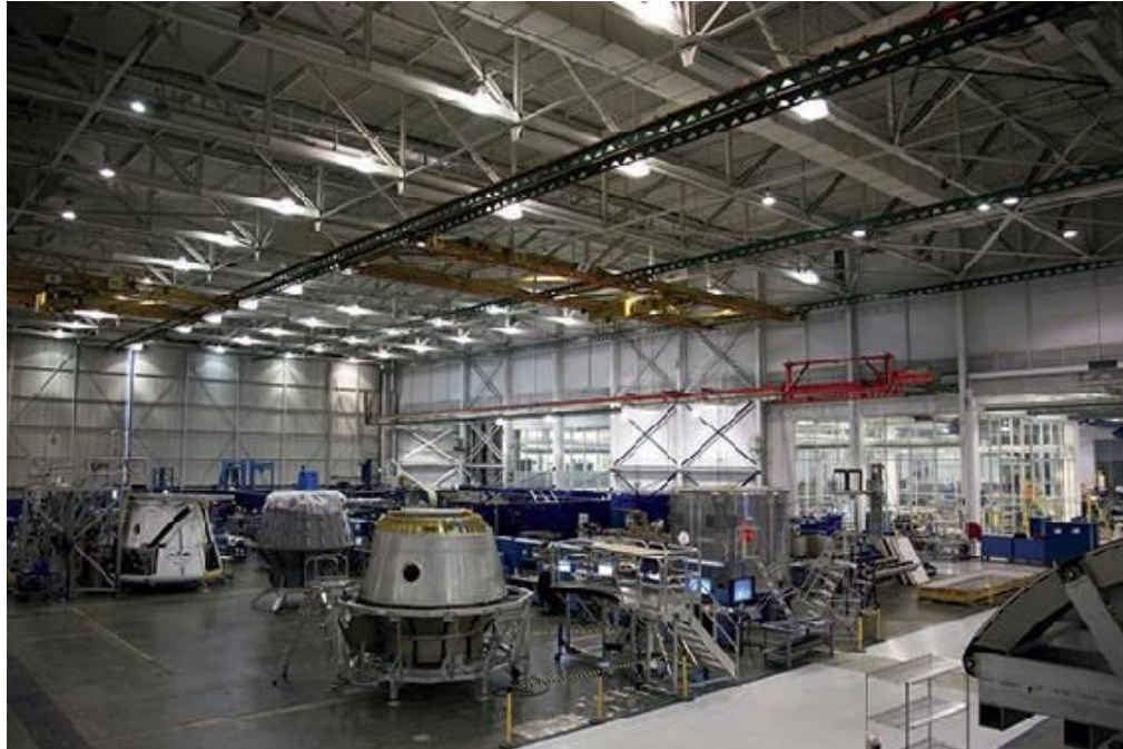
When SpaceX moved to a new factory in Hawthorne, California, it was able to scale out its assembly line and work on multiple rockets and capsules at the same time.