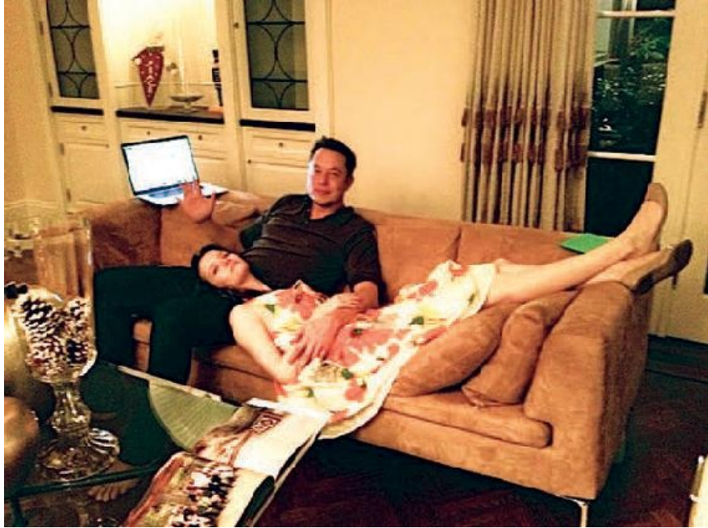
Musk and Riley relax at home in Los Angeles. Musk shares the home with his five young boys.