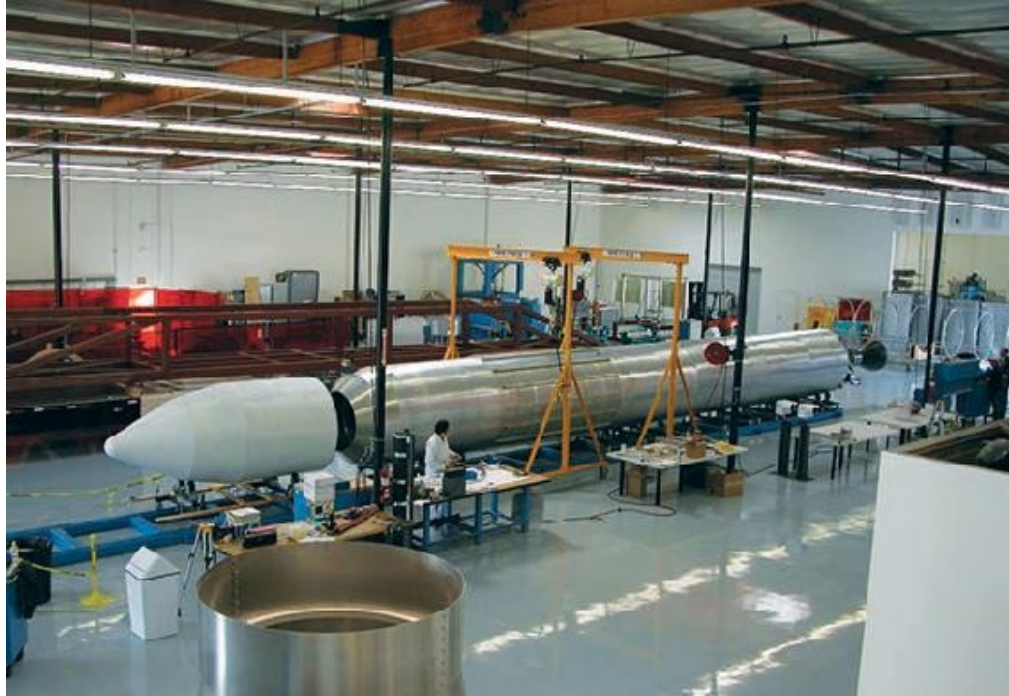
SpaceX built its rocket factory from the ground up in a Los Angeles warehouse to give birth to the Falcon 1 rocket.