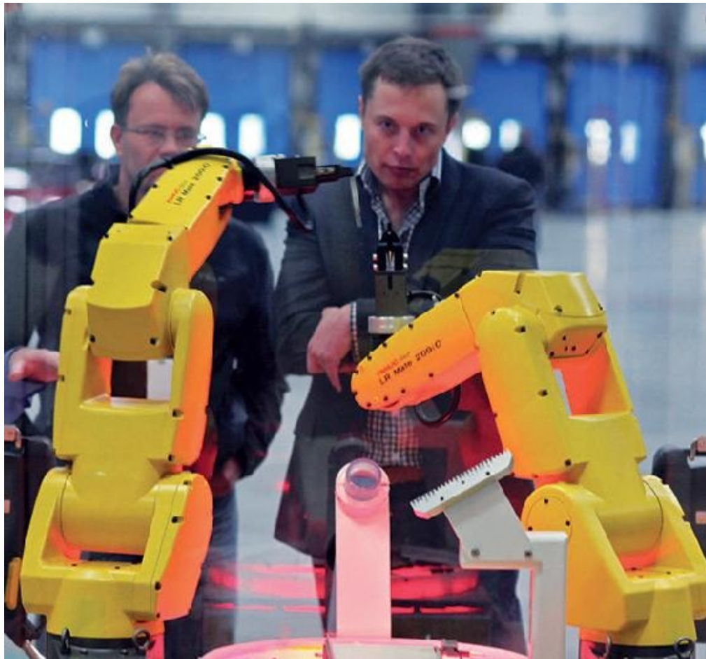
Musk has long had a thing for robots and is always evaluating new machines for both the SpaceX and Tesla factories.