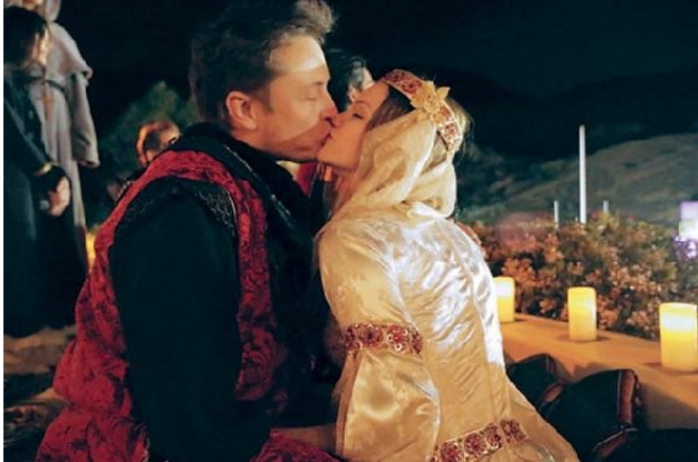
Musk married, divorced, remarried, and then divorced the actress Talulah Riley.