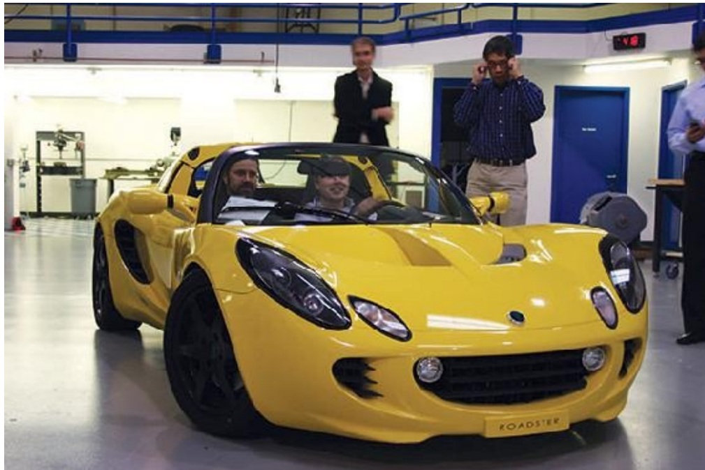
Musk and Martin Eberhard prepare to take the early Roadster for a test-drive. The relationship between the two men would fall apart in the years to come.