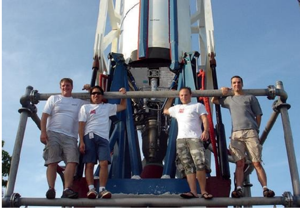
Tom Mueller ( far right, gray shirt ) led the design, testing, and construction of SpaceX's engines.