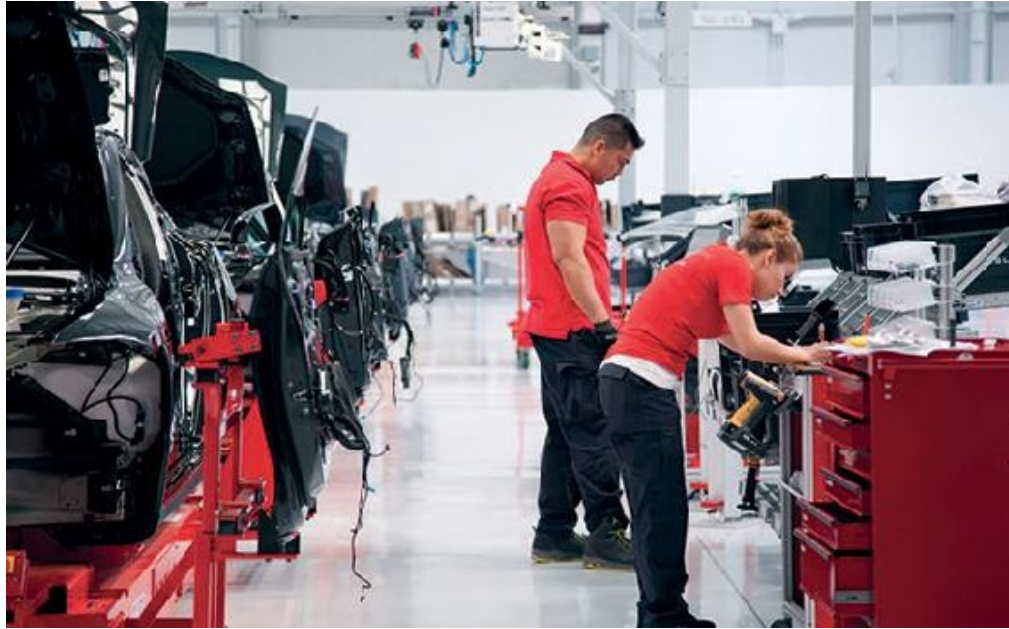
Tesla took over the New United Motor Manufacturing Inc. (or NUMMI) car factory in Fremont, California, which is where workers produce the Model S sedan.