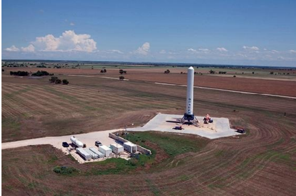
SpaceX tests new engines and crafts at a site in McGregor, Texas. Here the company is testing a reusable rocket, code-named “Grasshopper,” that can land itself.