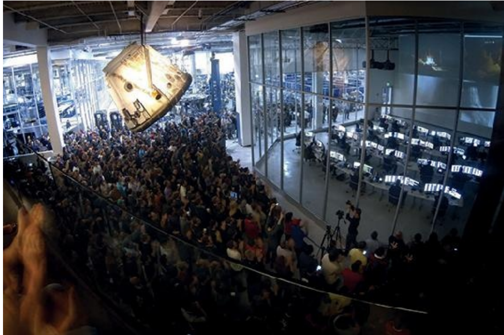
With a Dragon capsule hanging overhead, SpaceX employees peer into the company's mission control center at the Hawthorne factory.