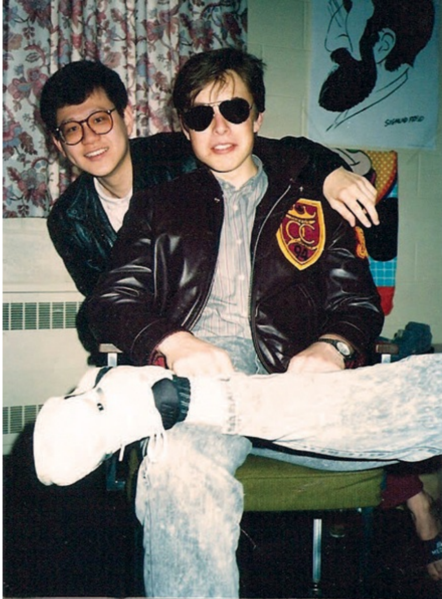
Musk ran away on his own to Canada and ended up at Queen's University in Ontario, living in a dormitory for foreign students.