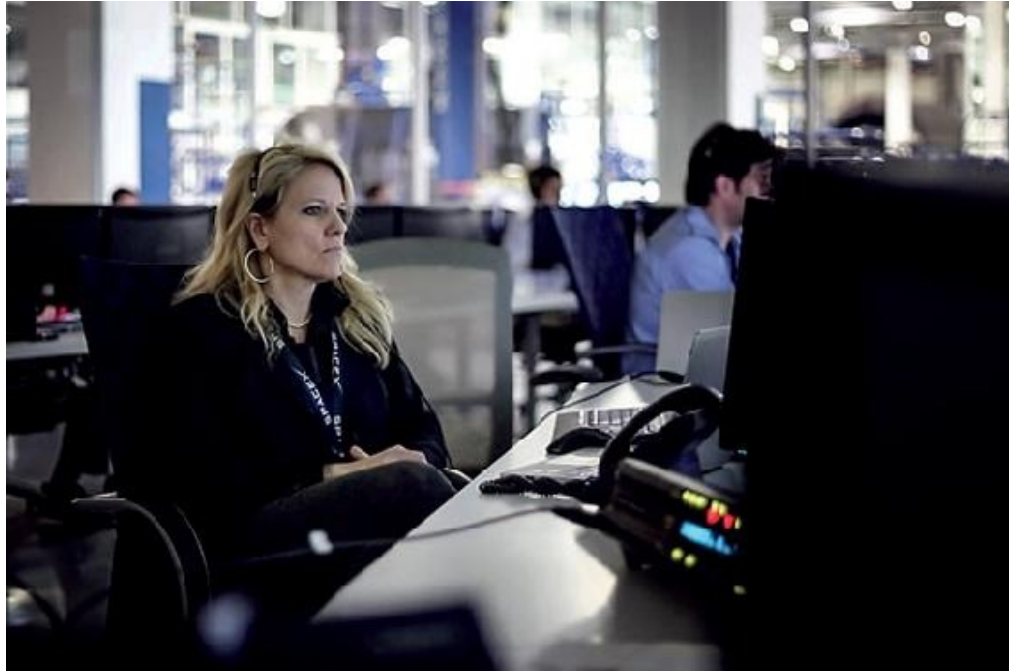
Gwynne Shotwell is Musk's right-hand woman at SpaceX and oversees the day-to-day operations of the company, including monitoring a launch from mission control.