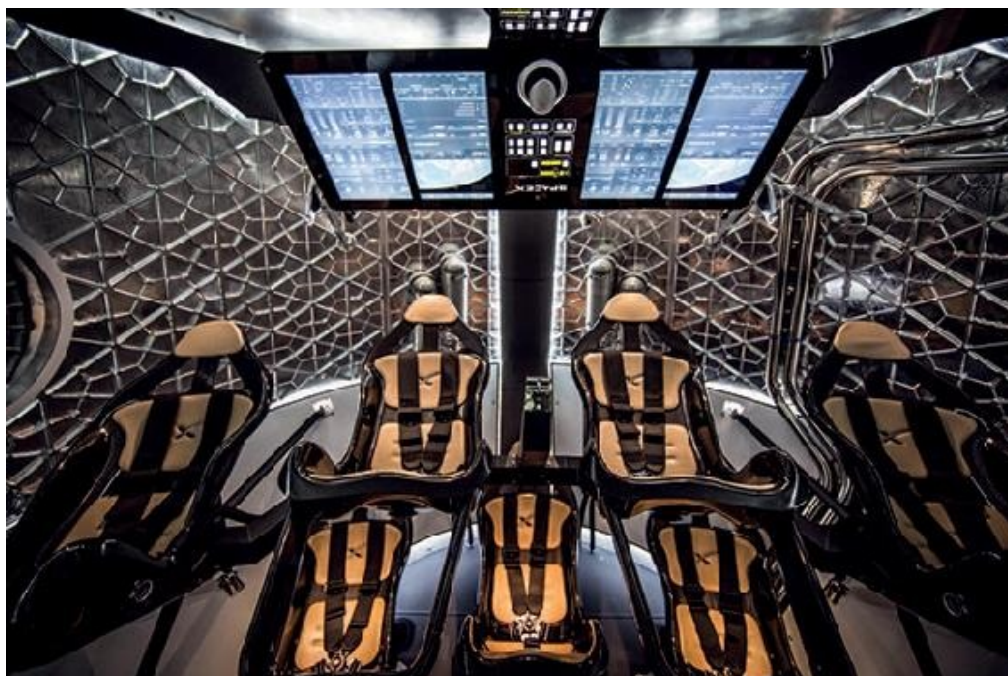
The Dragon V2 will be able to return to Earth and land with pinpoint accuracy.