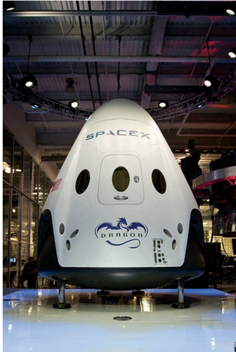
In 2014, Musk unveiled a radical new take on the space capsule—the Dragon V2. It comes with a drop-down touch-screen display and slick interior.