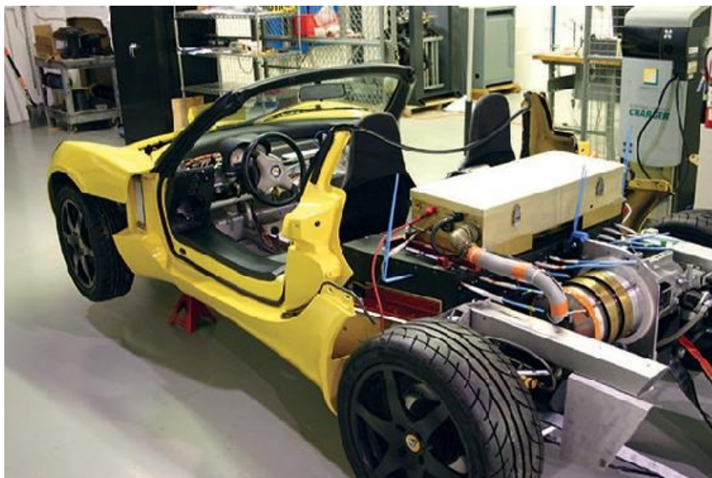
A handful of engineers built the first Tesla Roadster in a Silicon Valley warehouse that they had turned into a garage workshop and research lab.