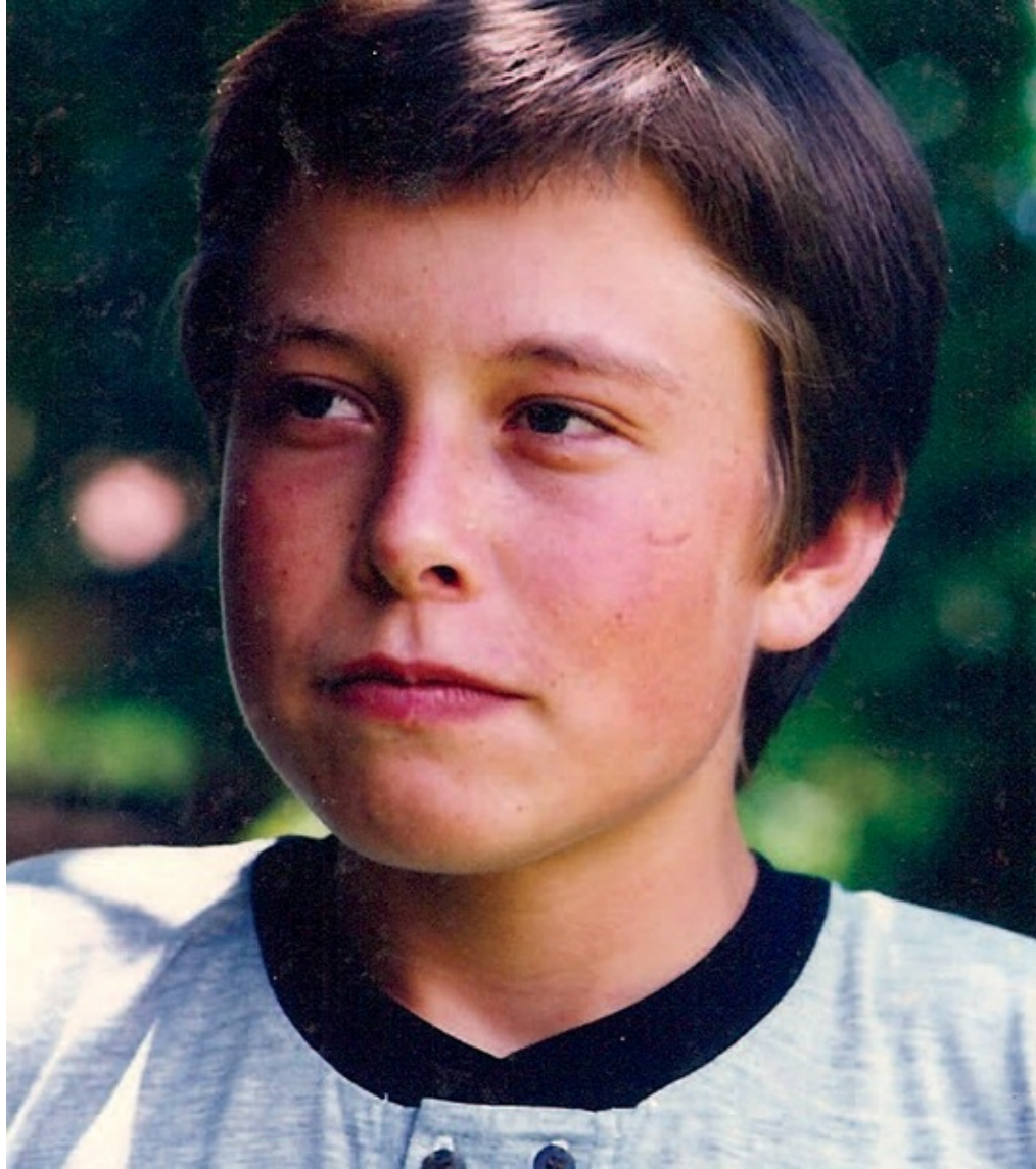
Musk was a loner throughout grade school and suffered for years at the hands of bullies.