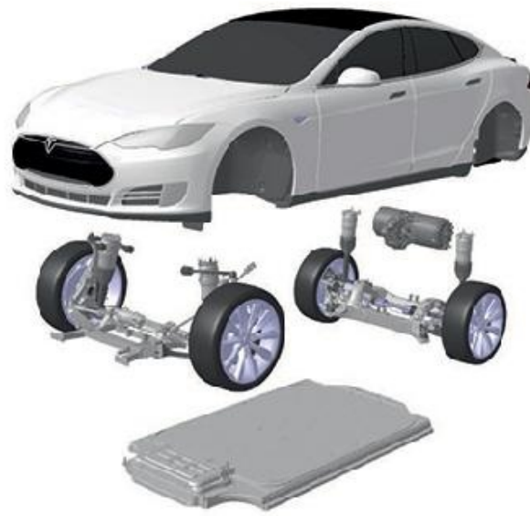
The Tesla Model S sedan with its electric motor ( near the rear ) and battery pack ( bottom ) exposed.