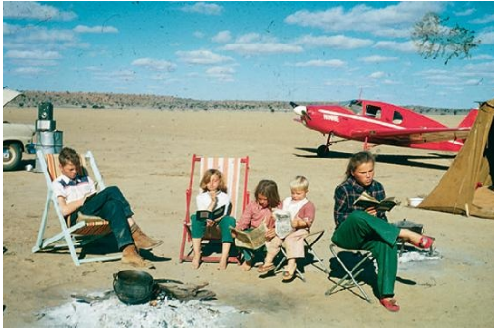
The Haldeman children had lots of downtime in the African bush while on wild adventures with their parents.