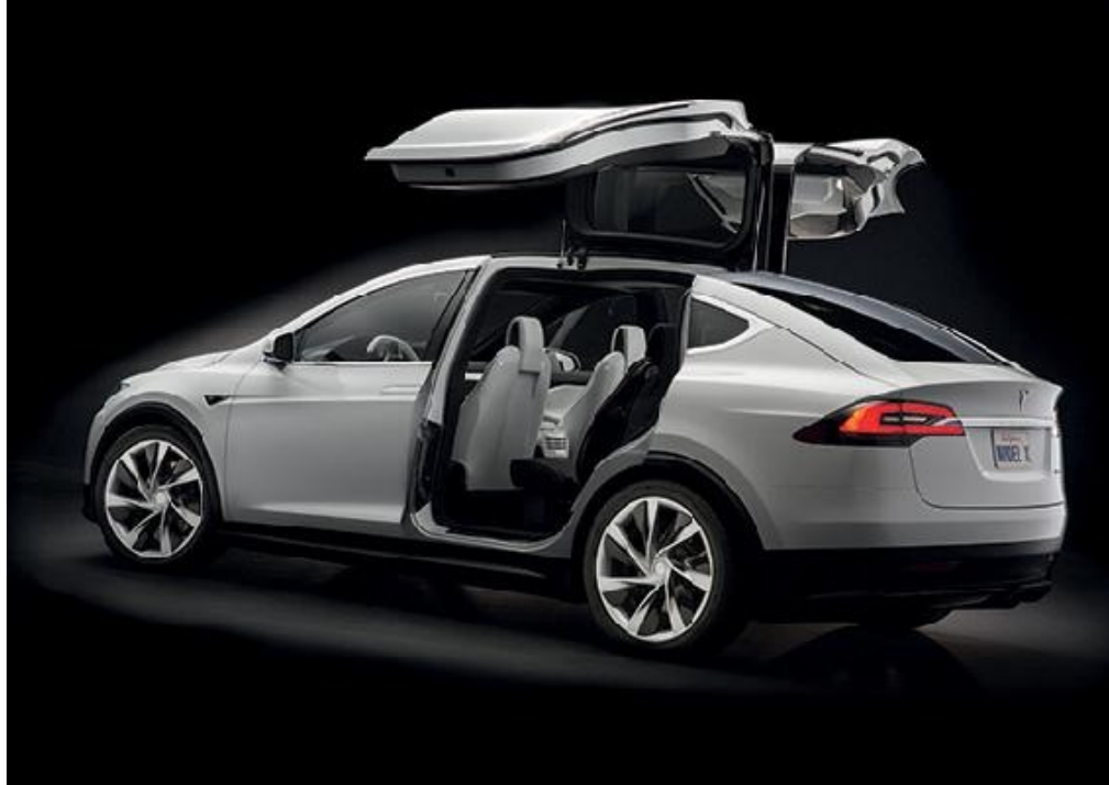
Tesla's next car will be the Model X SUV with its signature "falcon-wing doors."