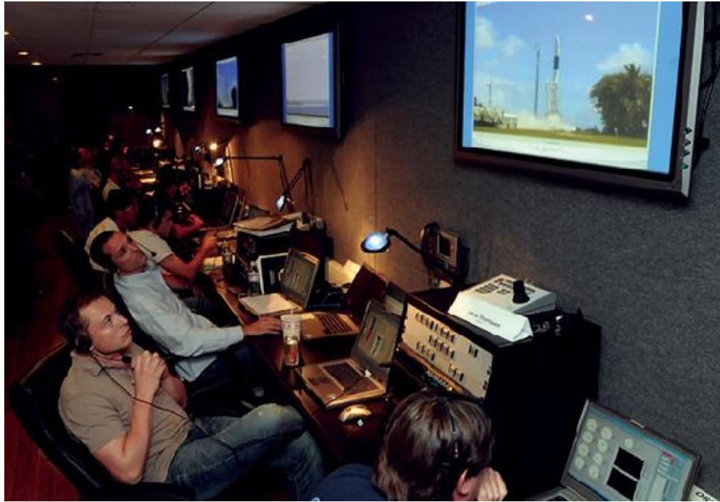
SpaceX built a mobile mission-control trailer, and Musk and Mueller used it to monitor the later launches from Kwaj.